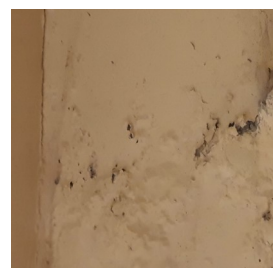
Plaster bubbling on all the walls