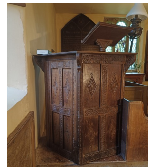
The pulpit “of great significance...possibly the only Cumberland example of vernacular carving with known provenance”

St John's Church has been the heart and soul of our West Cumbrian community for a thousand years. It is cherished by local people of all ages who come to worship, celebrate, remember loved ones and support events. Visitors come too, in increasing numbers in person and online, to enjoy this ancient site on the old Esk river crossing.