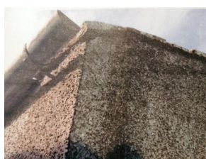
Cement render and modern plaster are causing condensation