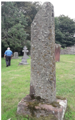
“an oasis of calm in a busy world”

A walk through history: a Celtic burial ground, two ancient crosses, a Roman pillar as a font, a Tudor pulpit, Georgian box pews