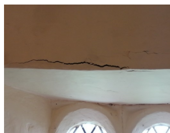
Cracks in lath and plaster