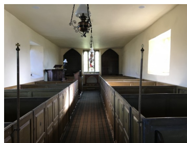
“a remarkably complete c1800 interior.....of considerable regional if not national significance”