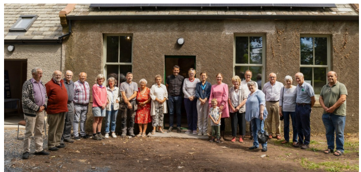
Community support enabling us to provide facilities on site.