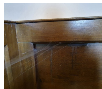
Old sawn panels are slipping