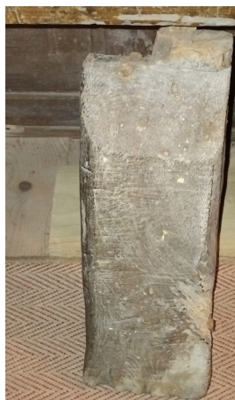
The Georgian pews are rotting and becoming unsafe