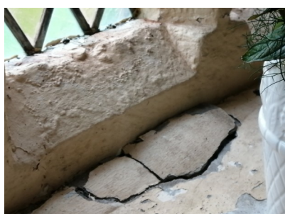
Old and modern plaster decaying