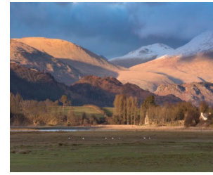
A spectacular setting

A walk through history: a Celtic burial ground, two ancient crosses, a Roman pillar as a font, a Tudor pulpit, Georgian box pews