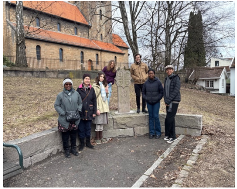
Youth confirmand retreat in March