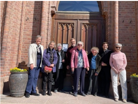
The Drammen Ladies' Guild Gathering in April

The Drammen Ladies Guild has met in February, March and April in Bragernes Church, continuing our now well-established pattern of joining midday prayers for peace in Norwegian before a simple service of Holy Communion in English.