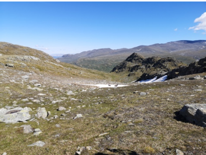
Beautiful Nature in Norway

In remembering also Sir David Attenborough's milestone 100th birthday in early May, we can take up the baton and both collectively and individually act on his optimistic call to protect planet Earth and all its inhabitants. "Nature once determined how we survive. Now we determine how nature survives." "No one will protect what they don't care about, and no one will care about what they have never experienced".