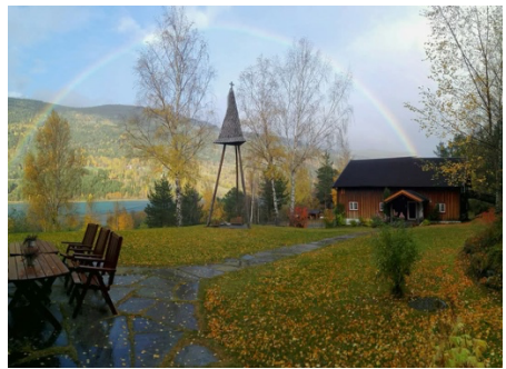
Rainbow Sighting at Sandom

And then lets you be alone. And yet, you are not alone. Others come this way too. We share the prayers. We share the meals. We share the space. We are all here without names or voices. But day after day We become familiar to each other. Little habits, ways of being and moving. The raised voices singing hymns And the voices allowed out in prayer. Some seem to want to smile. Others maintain a closed distance Even in near proximity. Why are we here? Why am I here? A breathing space. A cleansing place. A setting aside of inputs, Distractions, entertainments. What is left when we do that? Can I cope with an almost empty timetable? What's more, can I cope With a relinquishing of all responsibility? Letting others wait on me, prepare My programme, tidy up after me? Yes, it's a holiday in a way. And a privilege, a gift. But how strained we all look, Unspeaking, as we sit in the waiting room For breakfast, lunch or supper, Not quite knowing where to look, Or what to do with our hands. It's easier in the chapel. Then we know we're there to meet God. Our thoughts and bodies seek a posture Suitable to the occasion. We close our eyes, or look towards The altar, and the forested mountain Through the window behind. We can pray for each other, All sitting in our allotted places, But we do not need to worry.