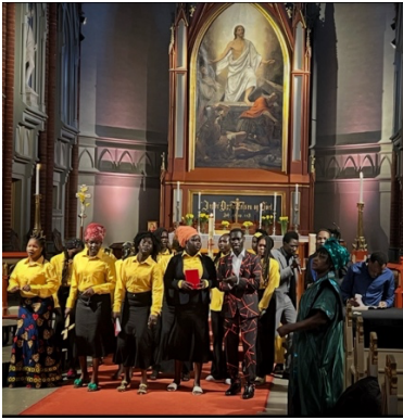
Maban Community Choir at Bragernes Church