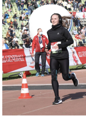
Generali München Halbmarathon 2021

Just get up and go. Walk and run. Go places. For me, running has never really been about competition. I simply love exploring. It started with forests and mountains near my hometown, and slowly grew into exploring the world, from Vienna, Berlin, Munich, London, Paris, and New York to Lisbon, Prague, and many places across Norway. Every run is a story on its own.