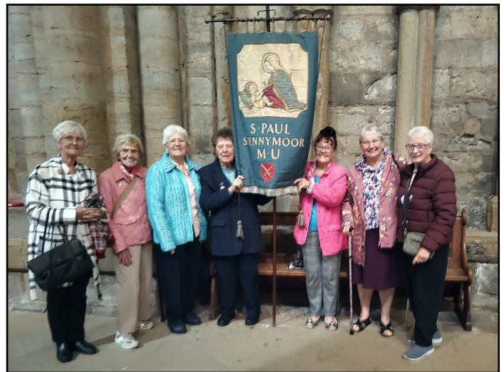
Members of the St Paul's branch of the Mothers' Union at Durham Cathedral

At St Paul's there will be an Overseas Coffee Morning on Saturday 19th September, so pop the date in your diary now! The event will support projects to empower women around the world by providing education courses and giving prac-