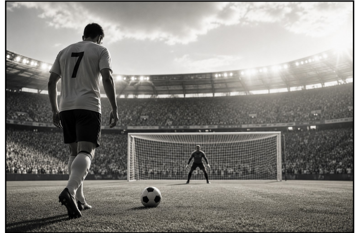
An AI generated image of a penalty shoot-out

Still, when we hear phrases like “press on” and “determination,” we