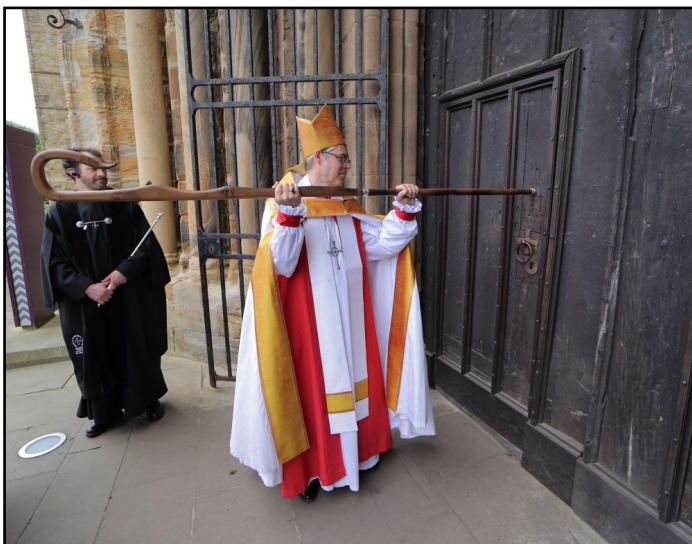
The Bishop of Durham knocks on the Cathedral door three times with his pastoral staff to request entry

One other date for your diary is that Mary Sumner Day, the Mother's Union founder will be marked with Evening at Durham Cathedral on Sunday 9th August at 3:30pm and all are welcome to attend.