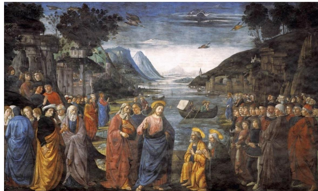
Vocation of the Apostles, Domenico Ghirlandaio 1481-82

Suggested hymn to sing or read Jesus, the name high over all.