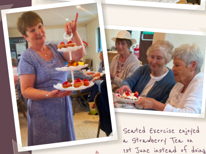
Seated Exercise enjoyed a Strawberry Tea on 1st June instead of doing their usual exercises.