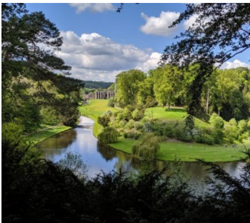
Studley Royal Water Garden

Being challenged and encouraged not to take the Bible too literally, and to have the opportunity to study material for the Advent and Lent courses. I appreciate very much the fact that St. Michael's is a Eucharist based