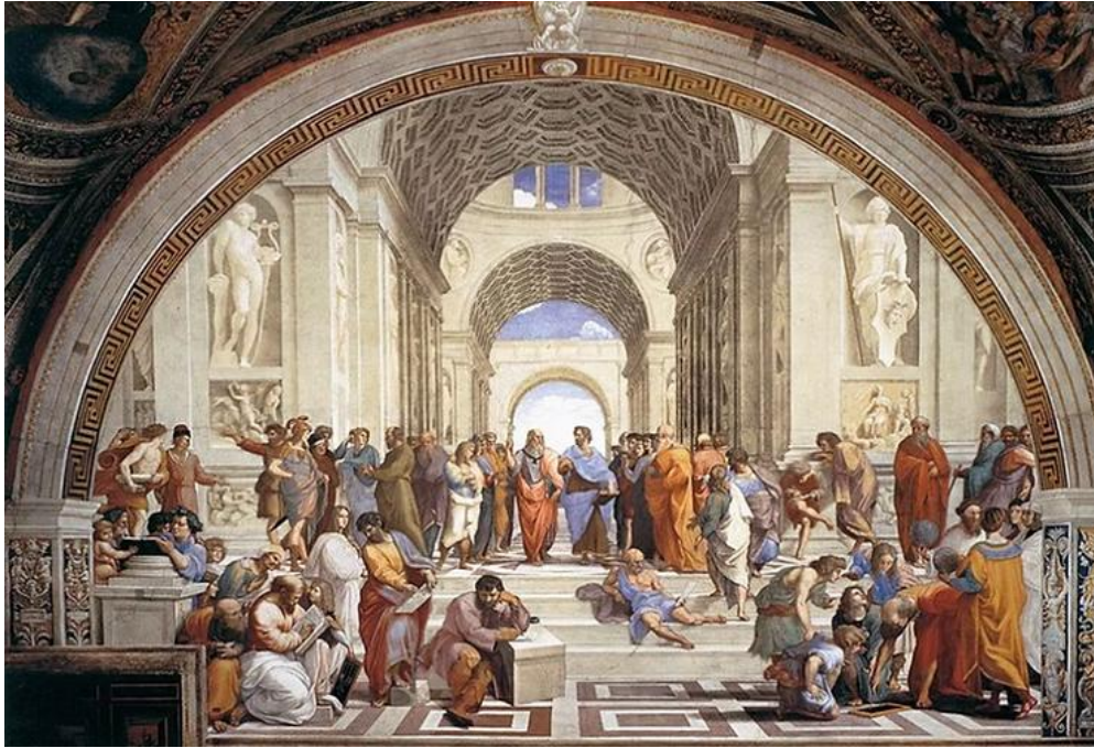
The School of Athens – Raphael.