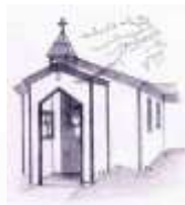
Our Lady & St Anne, Widemouth Bay