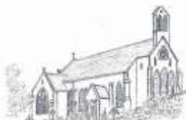
St Michael & All Angels, Bude