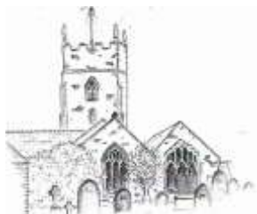
St Marwenne, Marhamchurch