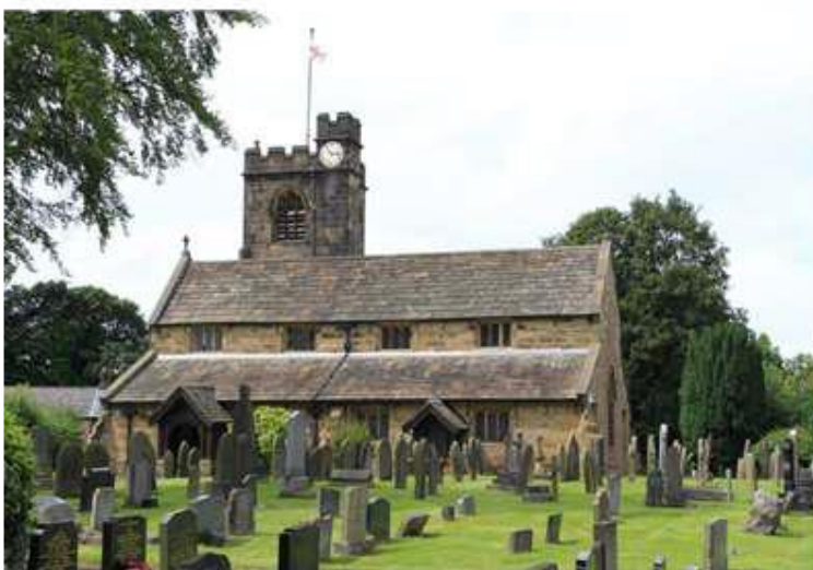
St Leonard the Less Samlesbury