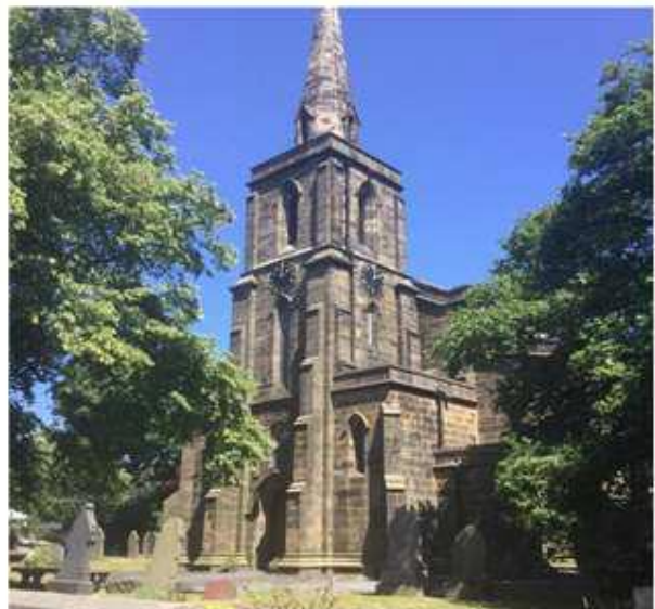
St Mary's Mellor