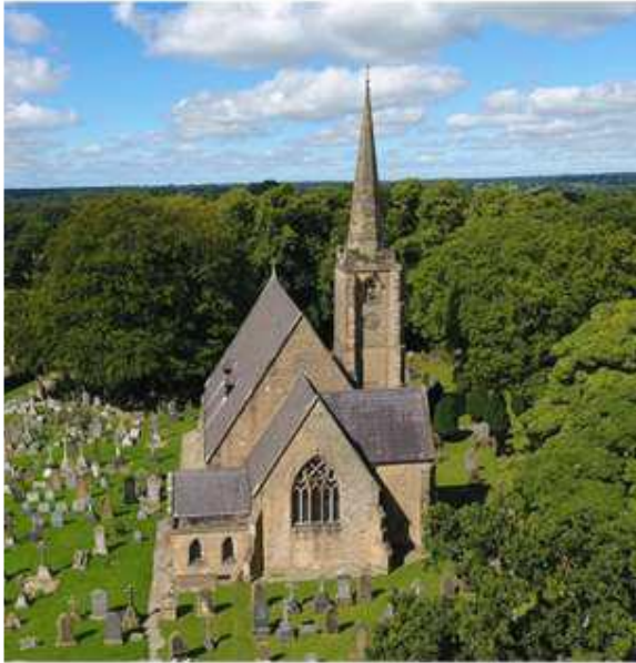
St Leonard's Balderstone

If you know anyone who would like to be added to our mailing list, please ask them to email UnitedBeneficeBMS@outlook.com or, for anyone who is not online, please phone 01254 937123.