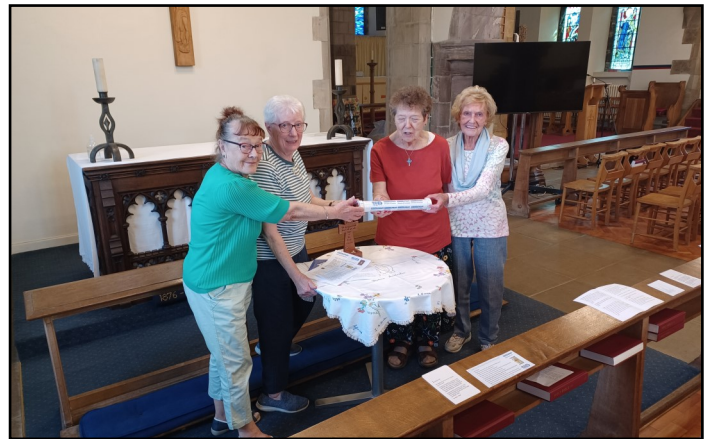
Members of the Mothers' Union with the prayer capsule

Later in June the cap-sule will arrive in Lon-don where it will be stored in the archives at Mary Sumner House, the Mothers' Union's head office.