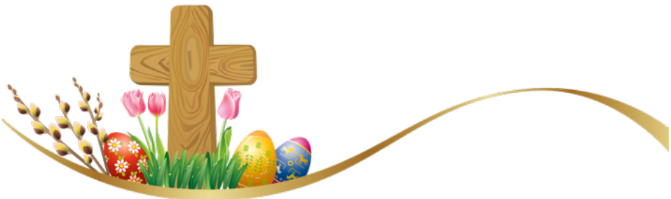
Cover photo: Camellia (Donation) (NH)