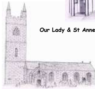
St Mary the Virgin, Week St Mary