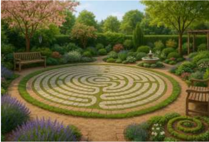
Artist's view of a quiet garden