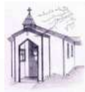
Our Lady & St Anne, Widemouth Bay