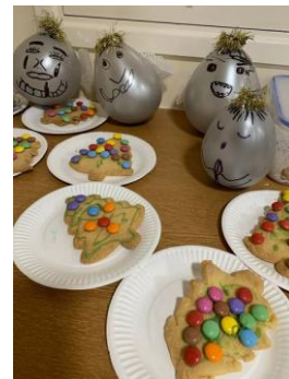
Christmas biscuits and wobbly angels

Messy church has continued successfully with numbers of children and adults attending ranging from 8 to 30. We estimate that over 20 different families have come to at least one session this is a significant outreach activity for the Church. We have covered a wide range of themes, including Bible stories such as creation, parables including the Lost Coin and significant times in the church year such as Pentecost and Christmas.