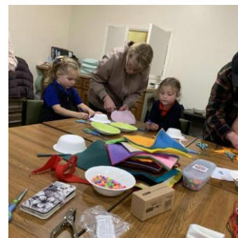
Making felt pouches

Sessions have been somewhat streamlined and the number of activities reduced to five each session, usually including clay and a baking activity as well as a wide range of other crafts and occasionally games. Parents and children are now encouraged to help clear away and assist with refreshments.