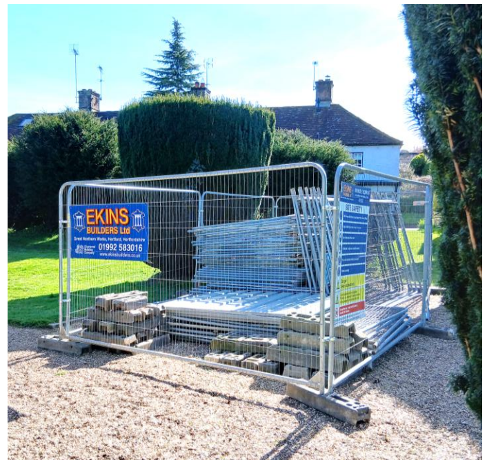
Fencing has already arrived on site