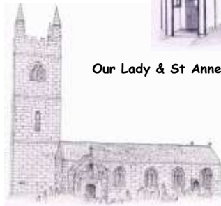
St Mary the Virgin, Week St Mary