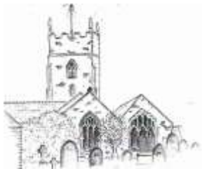
St Marwenne, Marhamchurch