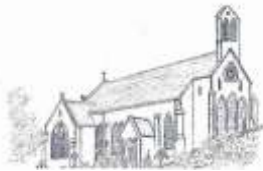
St Michael & All Angels, Bude