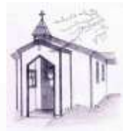
Our Lady & St Anne, Widemouth Bay