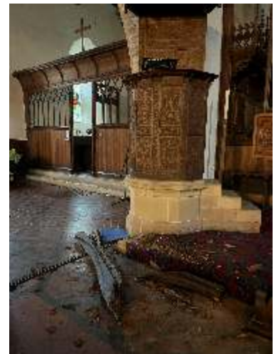
Fallen internal roof strut due to dry rot