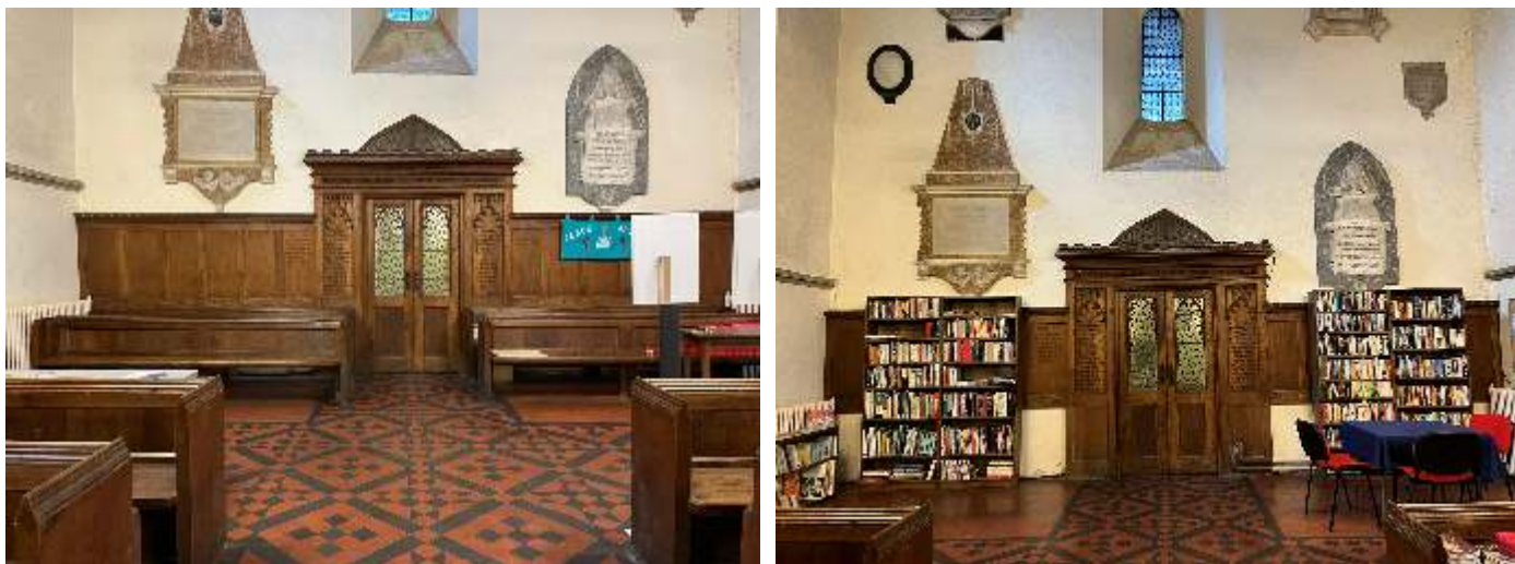
A New Community Library for Clun (before and after)