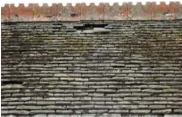
Roof repairs including blocked roof gully