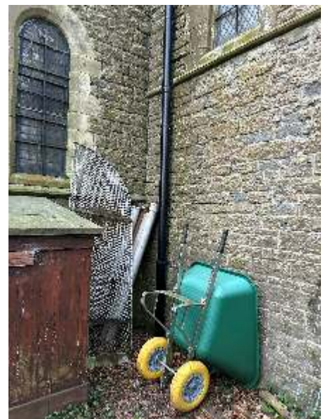
Temporary repair to fallen downpipe after Storm Darragh