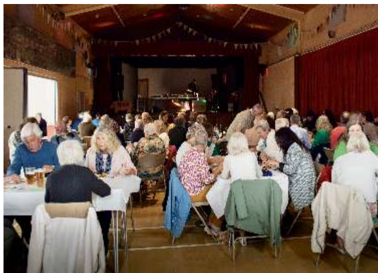
A birthday and anniversary party raised funds for our building fund