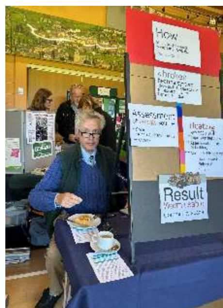
Two well attended exhibitions in church A commemoration of VE Day and the 'Now and Then' Exhibition