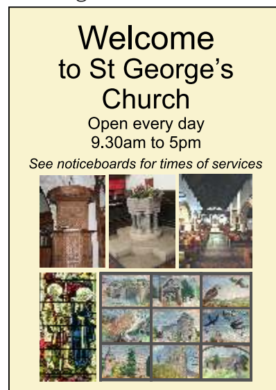
Well attended 'special' services, A display of our school children's Easter gardens, A new 'Welcome Board' A successful Clun Gardens Open Weekend for our general funds