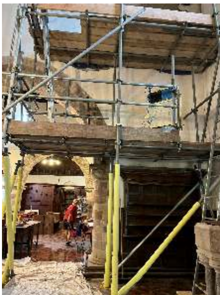
Flooding as a result of blocked roof drainage. Scaffolding in place because of fallen wall plaster repair