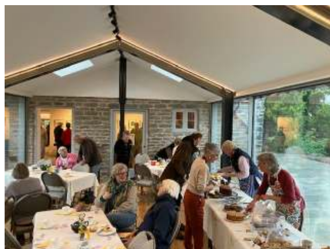
A sale of donated artist's work and afternoon tea raised money for our building fund

Tombola Bottle Stall on our carnival and show day raised funds for our building fund