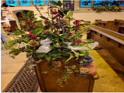
Photo : Christmas flowers, St Mary's, Brixham

1 st January is the traditional day to make New Year Resolutions. I don't usually bother as I know that they won't last a week, let alone a month. But this year I have jumped the gun somewhat, I made a resolution at the end of November '25, and I am now 15 days in and no sign of any wavering. I write a diary each night and prayers are added at the end so I have a record.