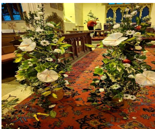
Picture: St Mary's, Brixham, Christmas flowers

Picture: All Saints', Brixham: Lyte Fingers craft group. 'Embarking on our 13th year of crafting together'. Proud to announce net takings of £1000 in 2025, for church funds.