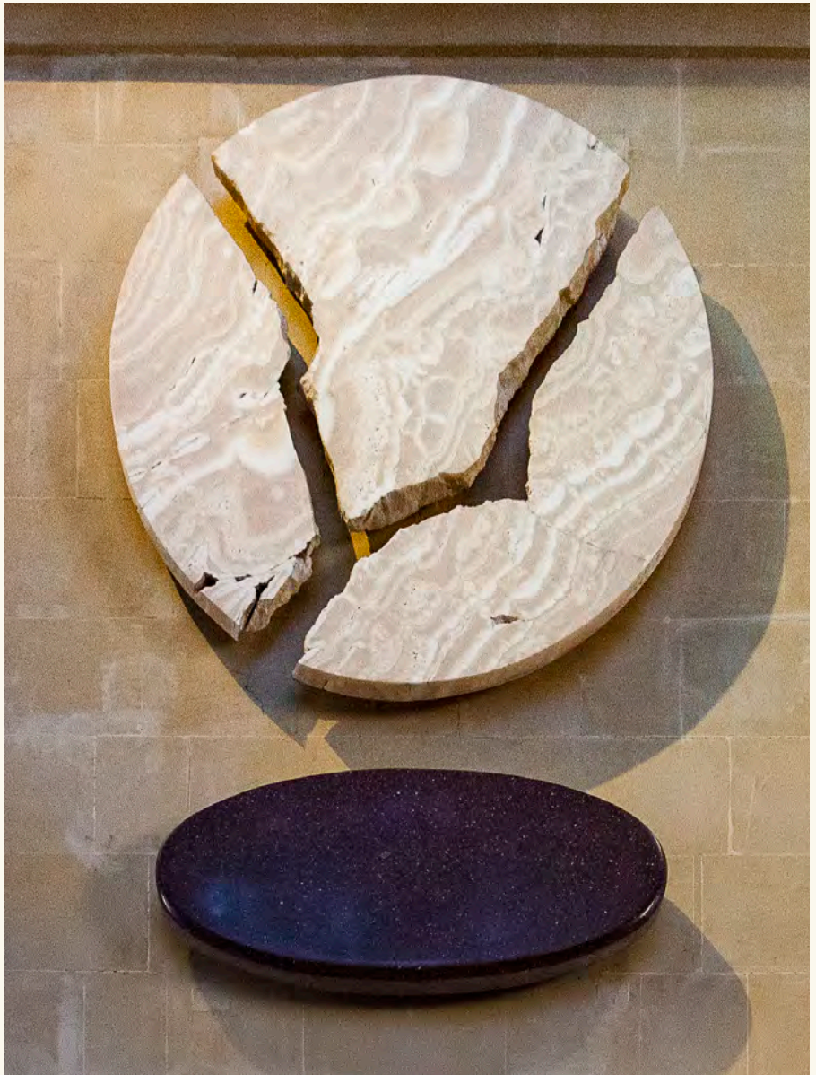
Bread and Wine: Newcastle Cathedral