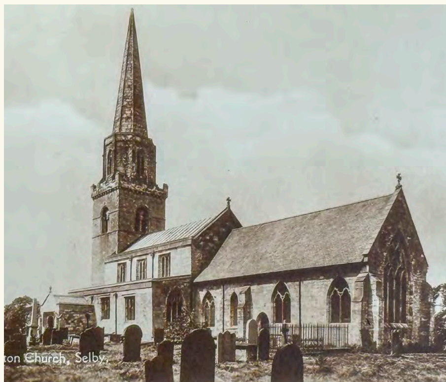
St Wilfrid's Church 1901

The thinking was that their life here on earth had ended and the person was now with God in heaven. Only those people in 'God's kingdom' would be allowed to be buried in the