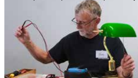
Seven lamps were repaired at the September café

They calculated that 395 kg of CO 2 were saved that afternoon by rescuing items that would otherwise now be buried in landfill, calculated as the equivalent of driving no less than 3,950 miles!