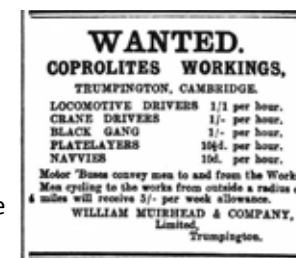
Advert from the Cambridge Daily News, 2 January 1918