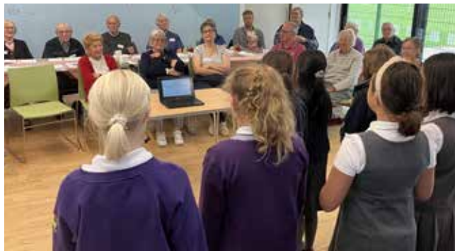
December 2025 & January 2026