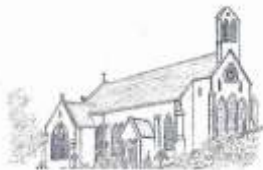
St Michael & All Angels, Bude