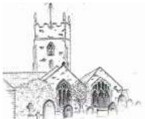
St Marwenne, Marhamchurch