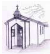
Our Lady & St Anne, Widemouth Bay