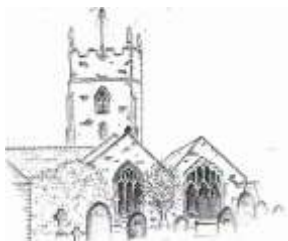
St Marwenne, Marhamchurch