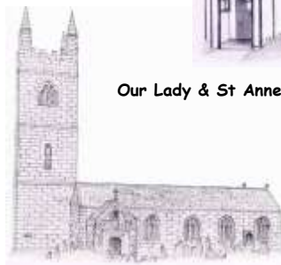
St Mary the Virgin, Week St Mary