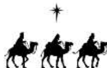
St Michael & All Angels, Bude