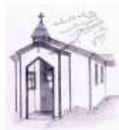
Our Lady & St Anne, Widemouth Bay