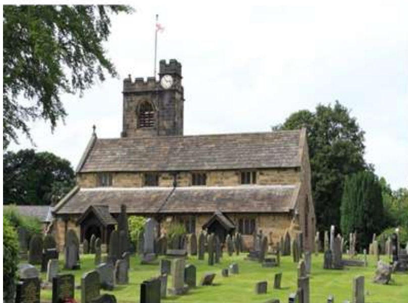
St Leonard the Less Samlesbury