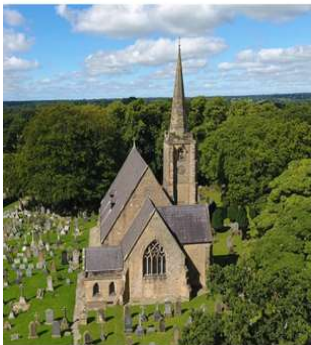
St Leonard's Balderstone

If you know anyone who would like to be added to our mailing list, please ask them to email unitedbeneficebms@outlook.com or, for anyone who is not online, please phone 01254 937123.