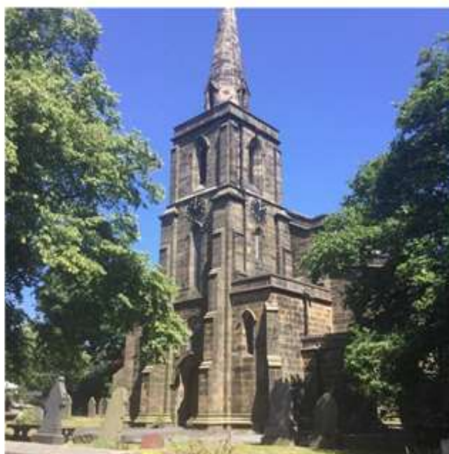
St Mary's Mellor