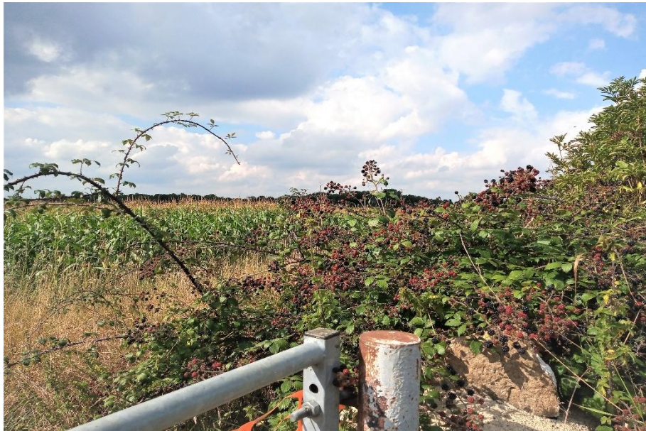
A good year for blackberries.