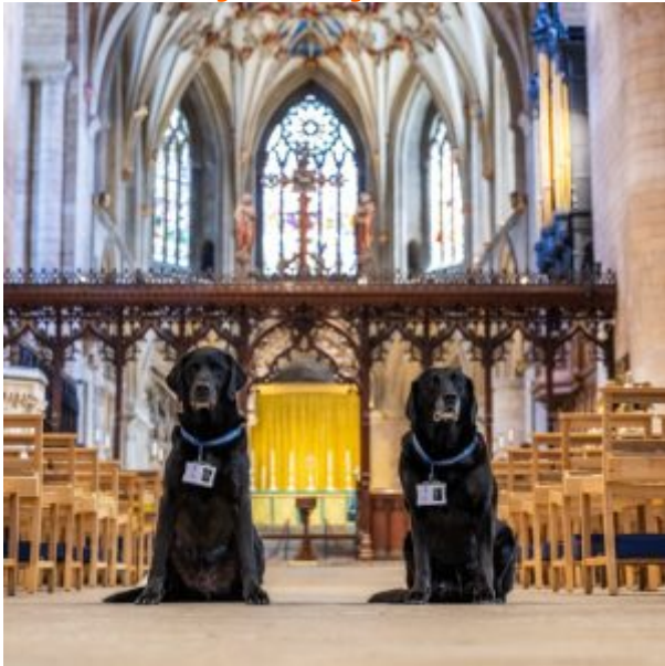
Eric and Flo.

After two years of service at Tewkesbury Abbey, labradors Eric and Flo will be retiring from their roles as Assistant Vergers to enjoy a relaxing retirement at home.