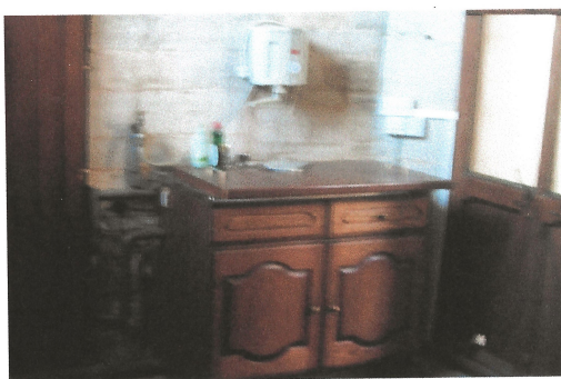
OLD REFRESHMENT AREA