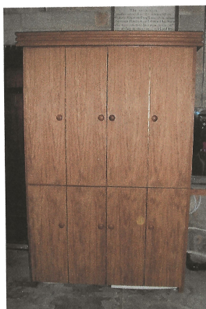
NEW REFRESHMENT CABINET