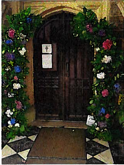
Our sister church St Mary Magdalene, Launceston, ready to welcome visitors to the Flower Festival

Looking through their historical records, having just had the gate and entrance archway refurbished, St Giles found the records for the