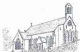
St Michael & All Angels, Bude