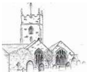
St Marwenne, Marhamchurch