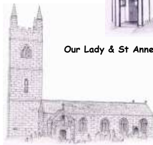
St Mary the Virgin, Week St Mary