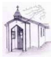
Our Lady & St Anne, Widemouth Bay