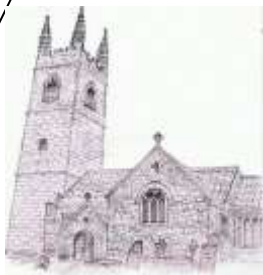
St Winwaloe, Poundstock