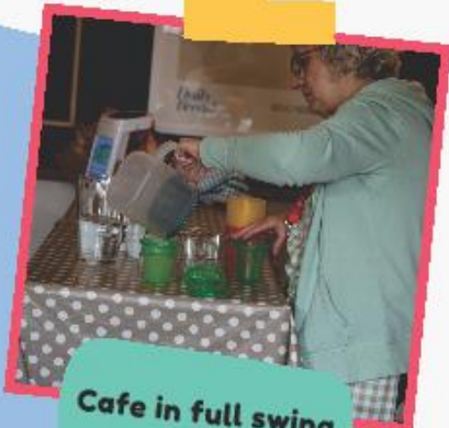
Cafe in full swing

Thank you to everyone who came along, lent a hand, or helped create such a vibrant and joyful day. Special thanks to our sponsor for the day which was J Barlow & Family Funeral Services.