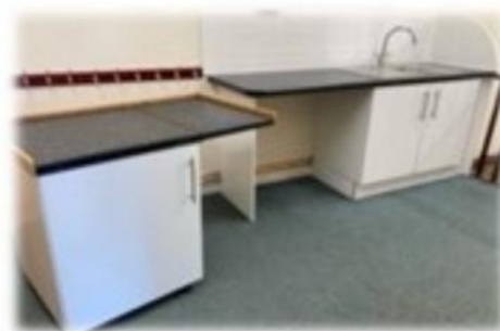
Upper Room Mobile Served

Please contact our Parish Administrator if you would like to book or have a look around our facilities.