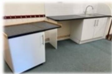
Upper Room Mobile Served

Please contact our Parish Administrator if you would like to book or have a look around our facilities.