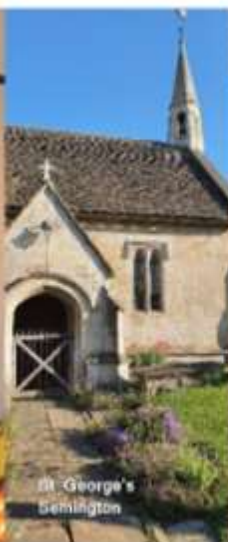
St. George's Semington