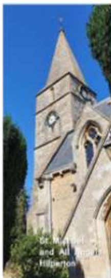
St. Michael's and All Angels Hilberton