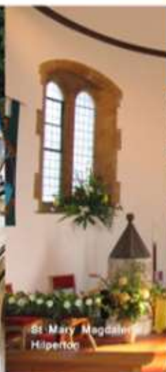
St. Mary Magdalene Hilberton