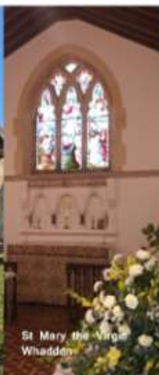
St. Mary the Virgin Whadden