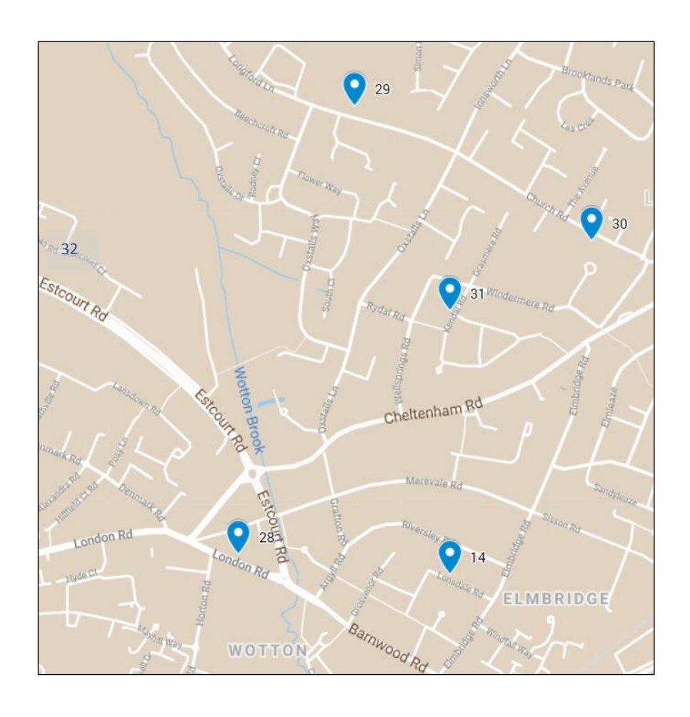
MAP A: North East Gloucester