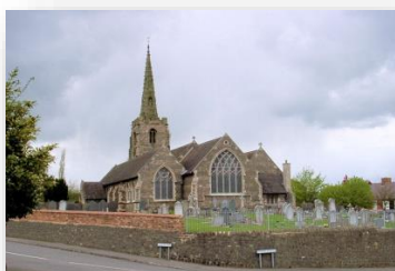
ST SIMON & ST JUDE CHURCH CHURCH ST/ALMEY'S LANE EARL SHILTON LEICESTER LE9 7DA

How often do you do that and is it time to be proud of what we are?