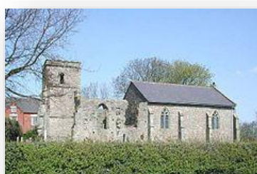
ST MARY'S CHURCH STATION ROAD ELMESTHORPE LEICESTER LE9 7SG