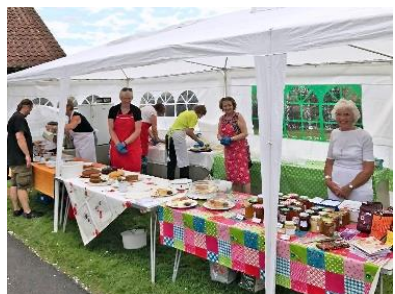
A St John's Cream Tea

We are an important part of the social life of our village, with our Lent Lunches, summer Cream Teas, Boules Club and Christmas Fair drawing large numbers of the village together.