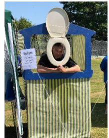
Village fete 2018