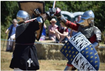
St James' Jamboree, 2018

We link regularly with Charfield school by taking a weekly "Open the Book" assembly in which we present Bible stories in drama... the children always look forwards to these.