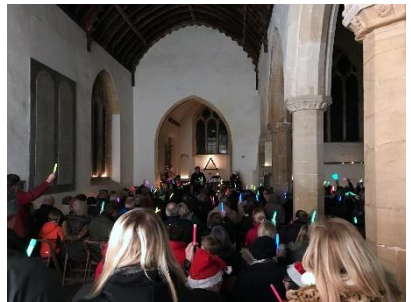
Annual Carol Service at St James

St James remained a place of worship until the 1960s, but is now in the care of the Churches' Conservation Trust. They allow us to use it for occasional worship, and we hold annual services on the Sunday nearest St James' Day (25 th July) and at Christmas-time (Carols by Candlelight on the Saturday before Christmas. As congregations and clergy numbers