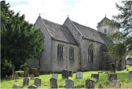
St James, Churchend

The original parish church in Charfield is St James, on Churchend Lane. It originated in the 13 th Century, but was rebuilt in the 14 th century.