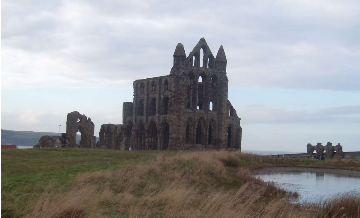
Whitby Abbey, Yorkshire

News from the Diocese of Hereford and the 17 Parishes around Stottesdon, Ditton Priors and Highley