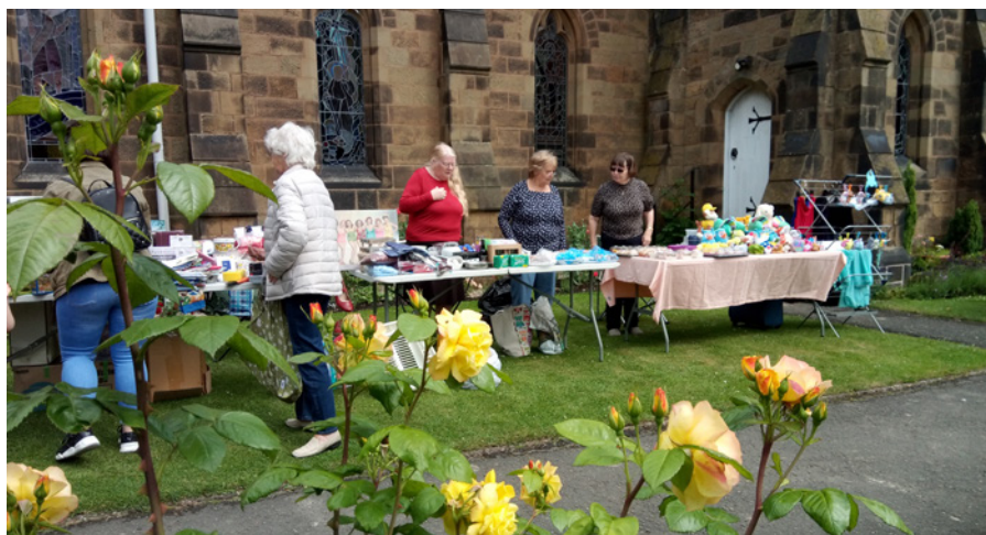
Table Top Sale