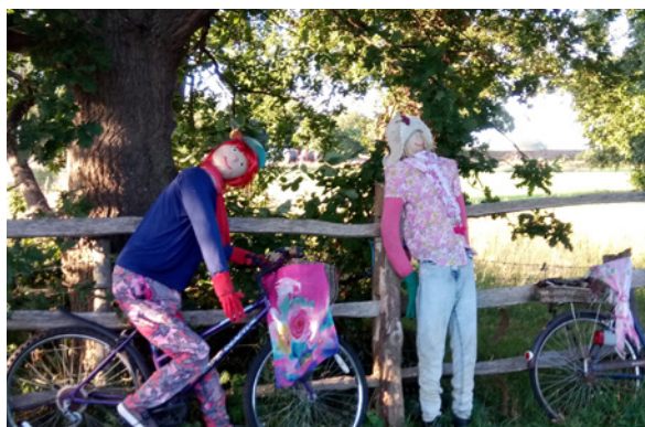
Ladies' Group visit to Elford Walled Garden