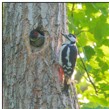
Woodpecker family in Withnell Fold Nature Reserve