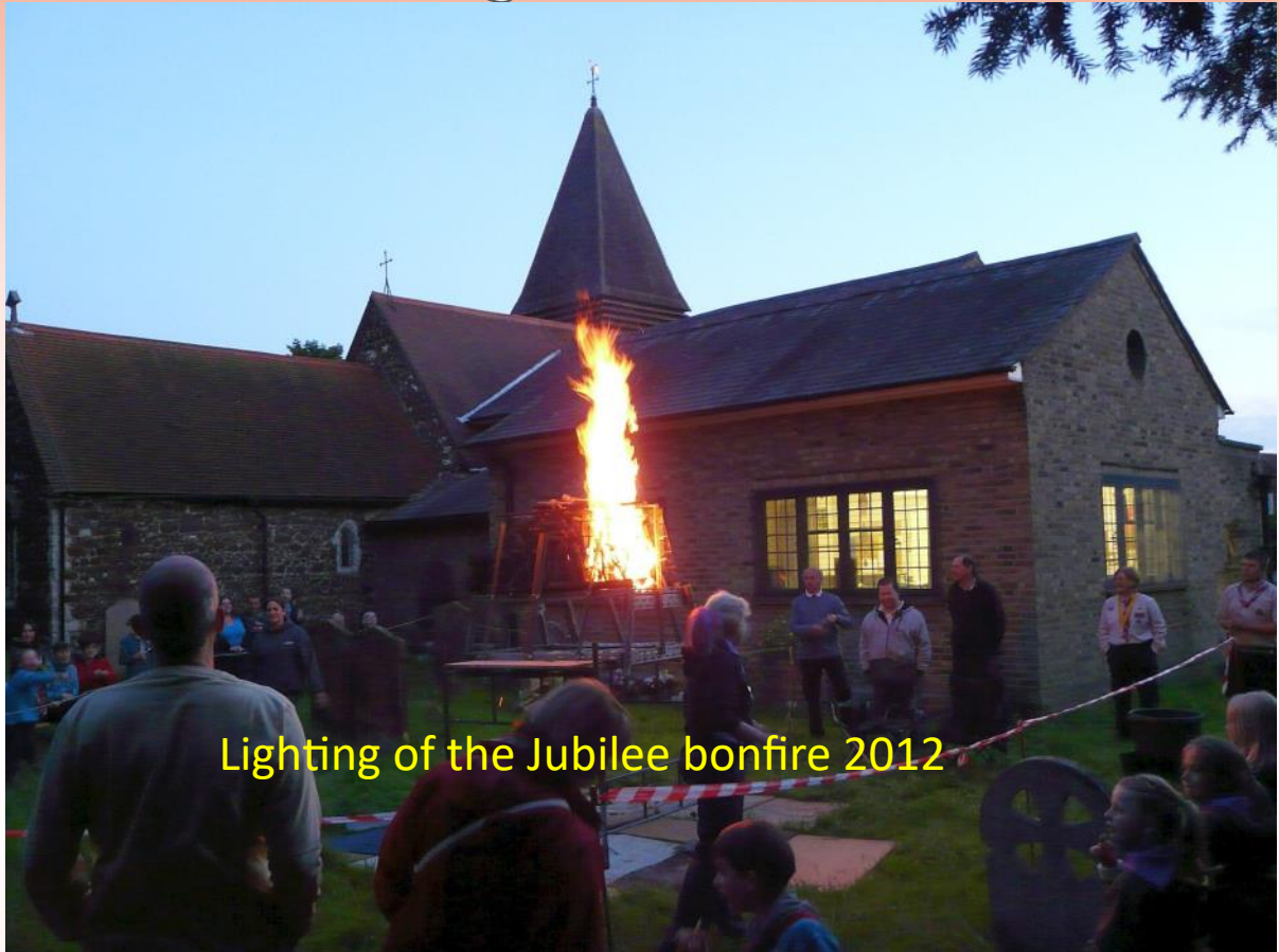
Lighting of the Jubilee bonfire 2012