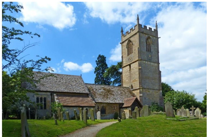
10.30am St Peter's, Little Comberton (MP)