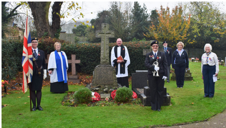
A short Service of remembrance was held at the war memorial at St Paul's Church, Dosthill.