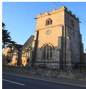
10.30am Holy Trinity, Eckington