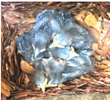
This nuthatch's nest is made up entirely of oak leaves

Supporting the needs of all in our woodland are two organisations, the North York Moors National Park and the National Trust. In particular the National Trust designates the greatest proportion of volunteer hours in maintaining footpaths, reducing bracken areas, planting hedge rows, as well as erecting, maintaining and checking 80 bird boxes in Newton and Cliff Ridge woodland.