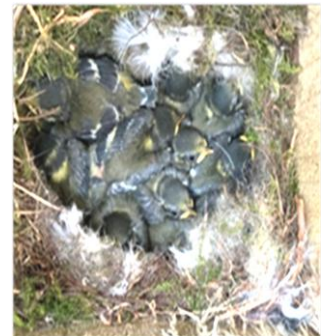
Great tit chicks

All the recorded data is forwarded annually to the British Trust for Ornithology and the RSPB to add to data from across the country in order to assess the health of the nation's bird population.