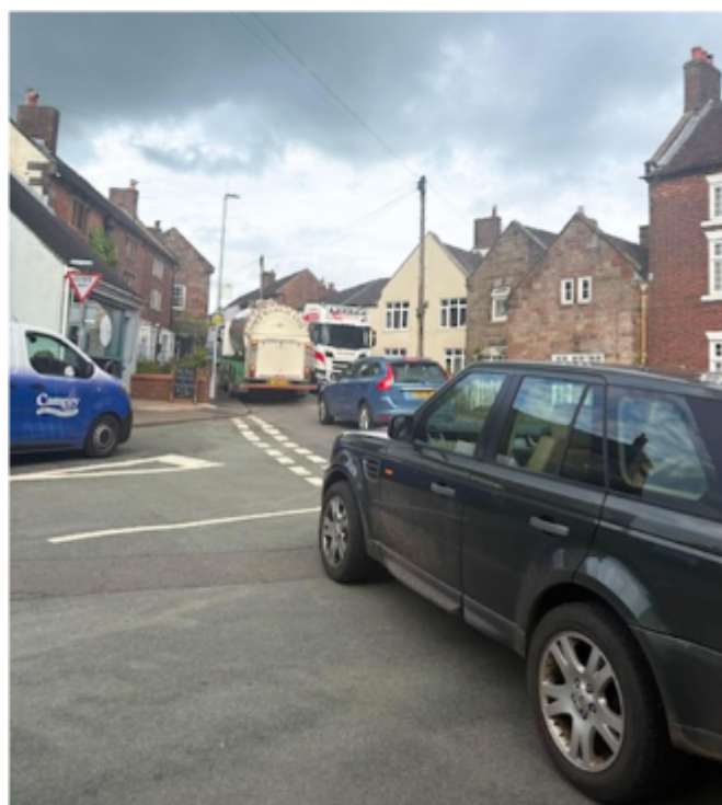
Pictured left and above is the problem congestion is causing in High Street