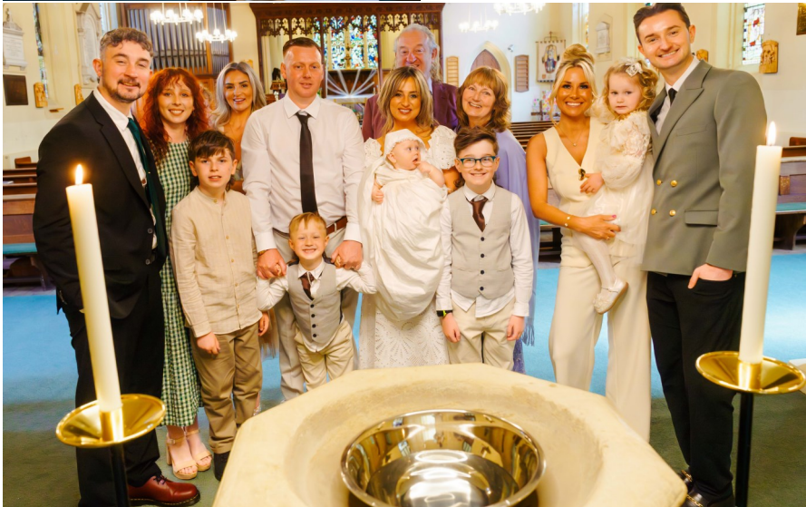
The happy scene afterwards