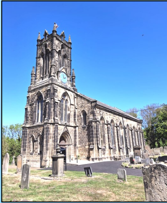
St. Alban's Earsdon