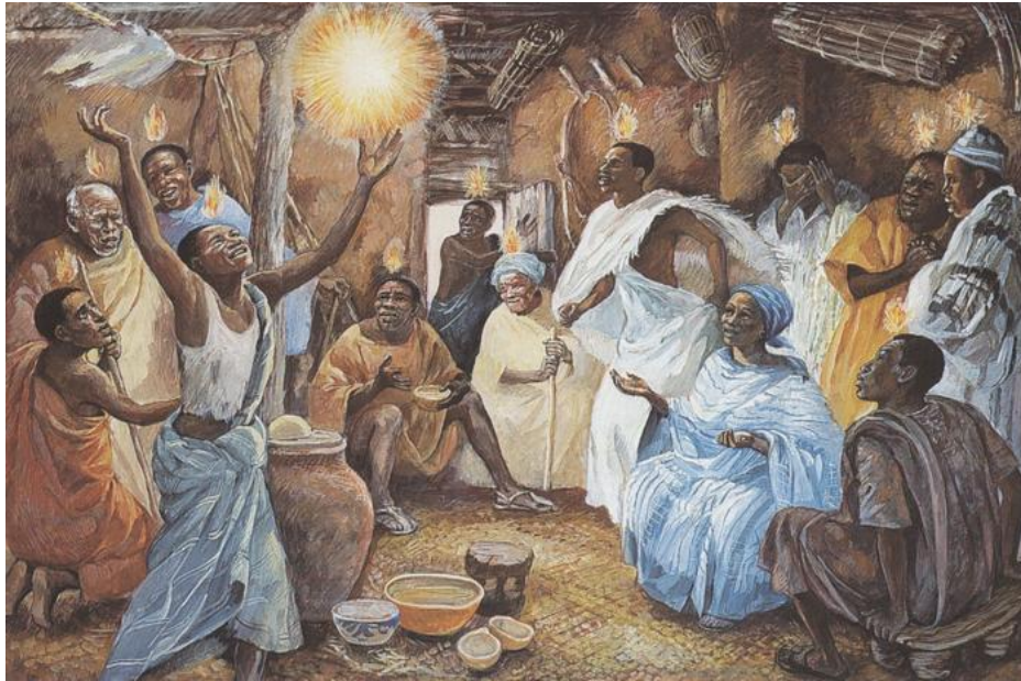
'Pentecost' by Jesus Mafa, Cameroon, 1973 1