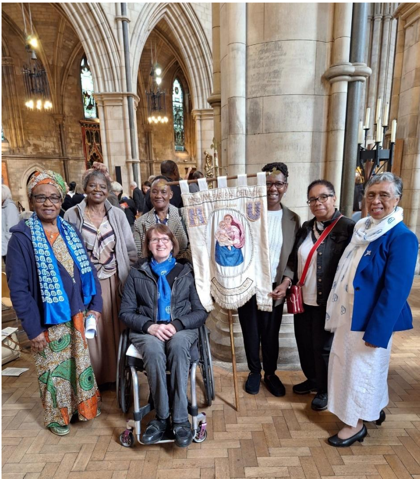
Mitcham Parish Church Mothers' Union members with our banner at the recent Festival Service held in Southwark Cathedral on Saturday 9 th May