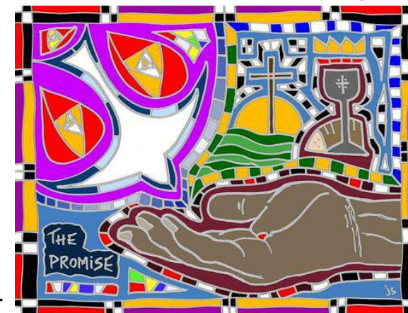
The Promise – Stushie