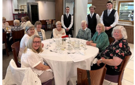
Photos taken on our trip to West Herts College where we ate delicious meals made and served by students.