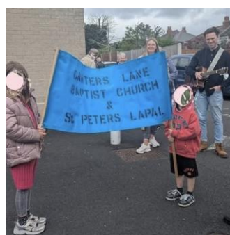
Palm Sunday march