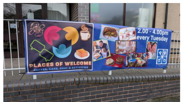
Places of Welcome new banner

Lapal school paid us a visit to explore the building.