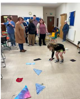
Faith N Fun