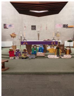
Crib service figures

We had over five hundred people through the church door over the Advent and Christmas period including Brownie's Christingle, Lapal School Carol Service, joint Carol service with Carters Lane Baptist Church, Christmas crib craft and create session (attended by 25 people) who made the characters and scenery for our Christmas Eve crib service, plus, normal Christmas services.