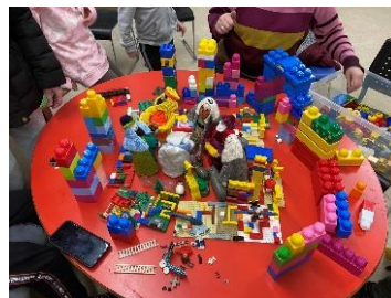
Faith N Fun