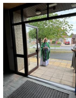
New church door blessing