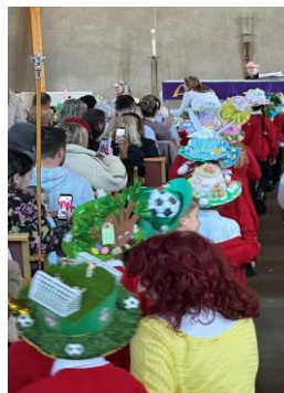
Local family present bible