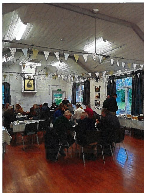
Tamar Guild of Ringers visit