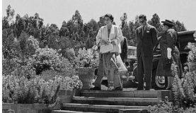
Princess Elizabeth and Prince Philip at Treetops Lodge, Nyeri, Kenya, 1952.

The day Elizabeth became queen in a treehouse in Kenya