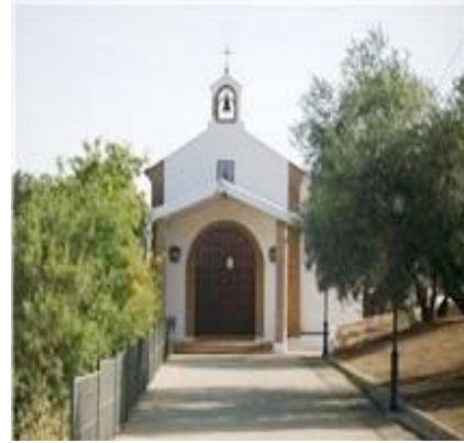
Church of the Sagrado Corazon de Maria, Salinas, Archidona Saturdays, 11.30 AM 2 nd and 4 th Saturdays of the month

https://www.achurchnearyou.com/church/8530/