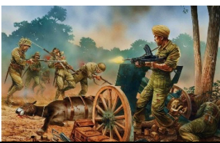
A scene from the Battle of Imphal.