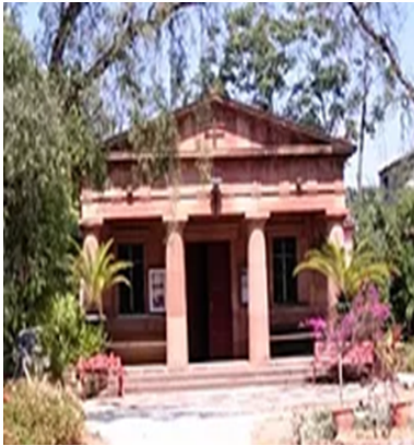
St George's Church, Av.de Priés 1, Malaga Sundays, 11.30 AM