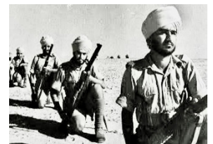
Soldiers of the 3rd Battalion, 6th Rajputana Rifles.