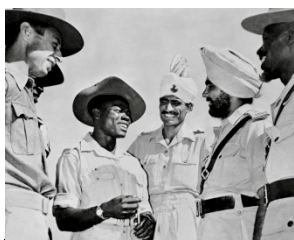
Sikh Soldiers of the 62nd Indian Infantry Brigades, British Indian Army, June 1945.

Lieut - General Stopford, Commanding, 33 Indian Corps. "